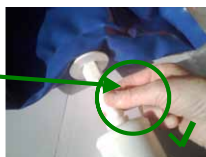
INSERT WHITE TUBE INTO CARTRIDGE & TIGHTEN NUT